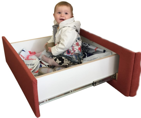
High Quality Drawers Big enough and strong enough to store almost anything'