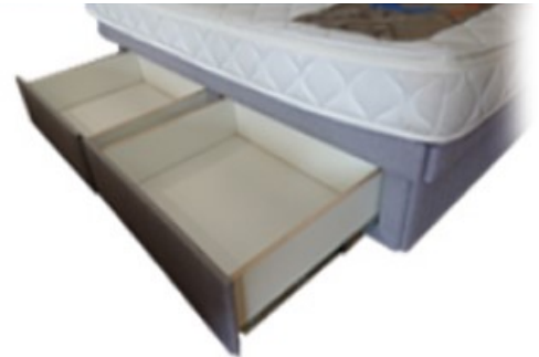
Option 'G' Large drawers for maximum storage space but will not clear bedside cabinets.

Please select your drawer option from the drop down menu.