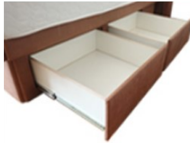
Option 'F' slightly smaller to clear bedside cabinets